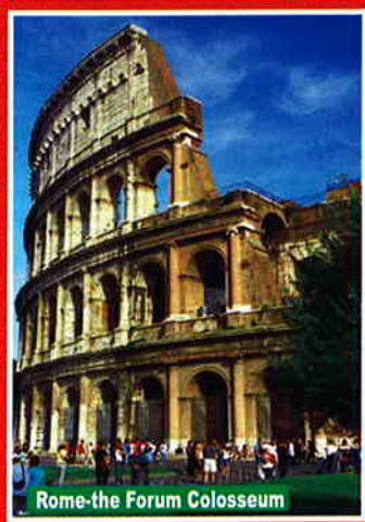
Rome-the Forum Colosseum